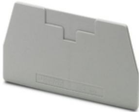
Cover, length: 72 mm, width: 2.2 mm, height: 41.5 mm, color: gray

Please be informed that the data shown in this PDF Document is generated from our Online Catalog. Please find the complete data in the user's documentation. Our General Terms of Use for Downloads are valid ( http://phoenixcontact.com/download )